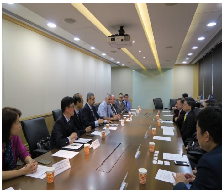
Photo taken during the meeting with HKIS President and their Committee Members