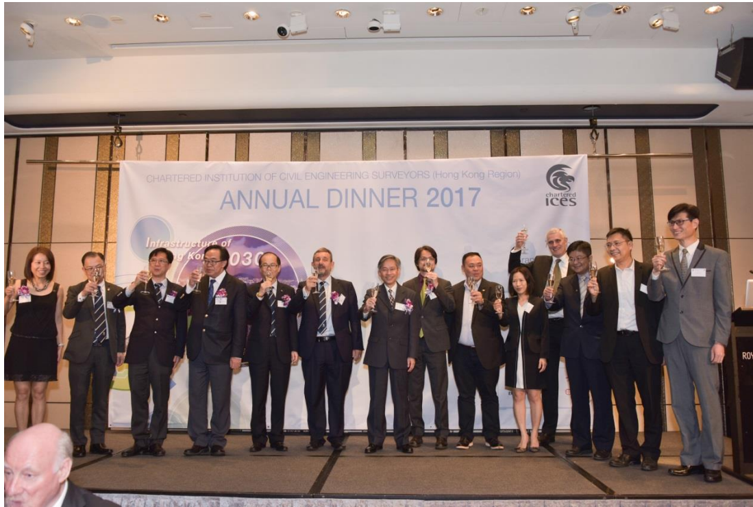
Another toasting photo of the President and the Chief Examiner together with the Hong Kong Region's Committee Members